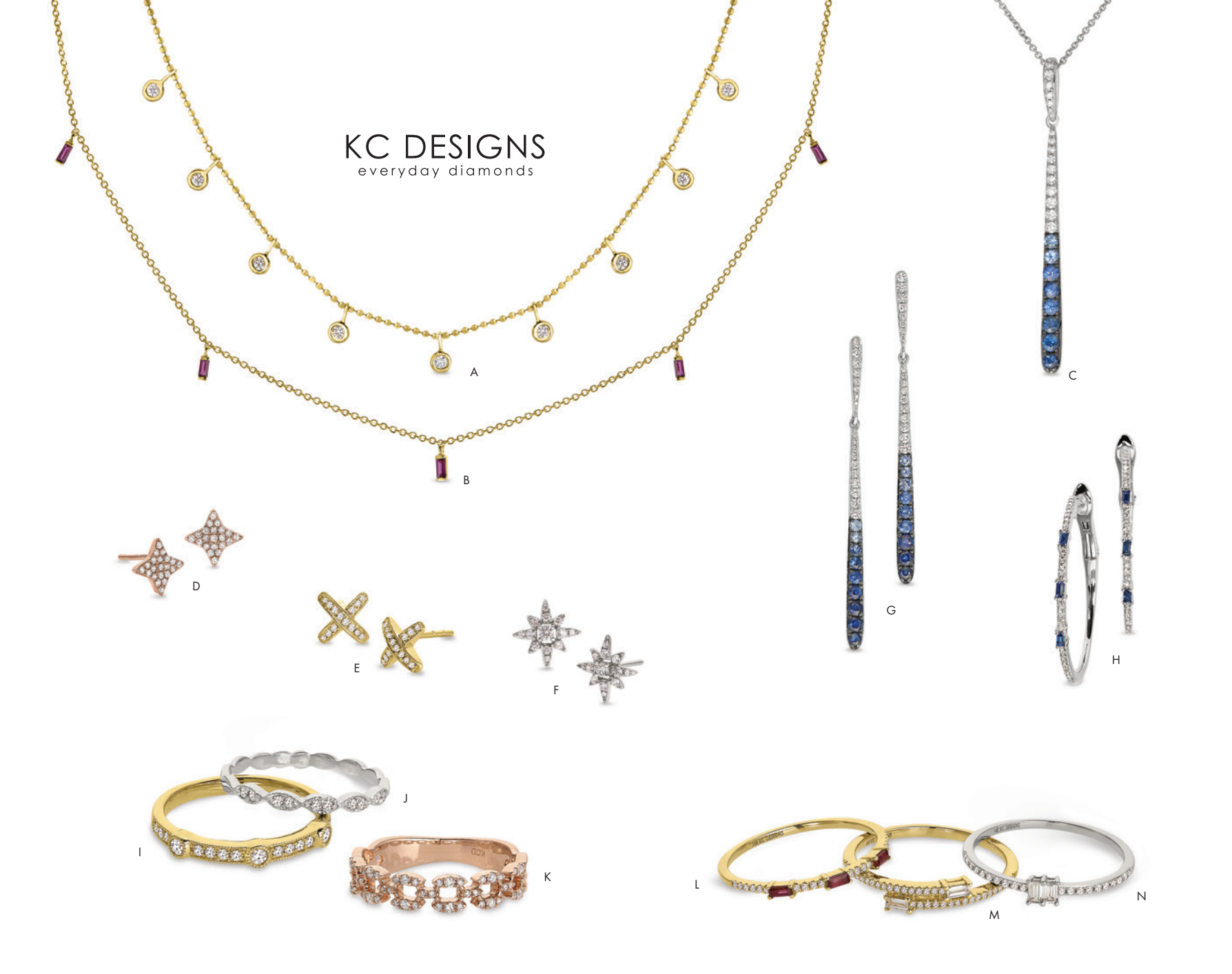
A. Diamond bezel drop necklace, $1,100 B. Ruby "baguette drop" Mosaic necklace, $675 C. Diamond and blue sapphire ombre necklace, $1,200 D. Diamond four point stud earrings, $550 E. Diamond "kiss" stud earrings, $495 F. Diamond starburst stud earrings, $875 G. Diamond and blue sapphire ombre earrings $1,200 H. Diamond and blue sapphire hoop earrings, $995 I. Diamond triple bezel stack ring, $1,200 J. Diamond marquise shape stack ring, $550 K. Diamond geometric stack ring, $1,175 L. Ruby and diamond Mosaic stack ring, $450 M. Diamond Mosaic stack ring, $575 All items are crafted in 14kt gold.