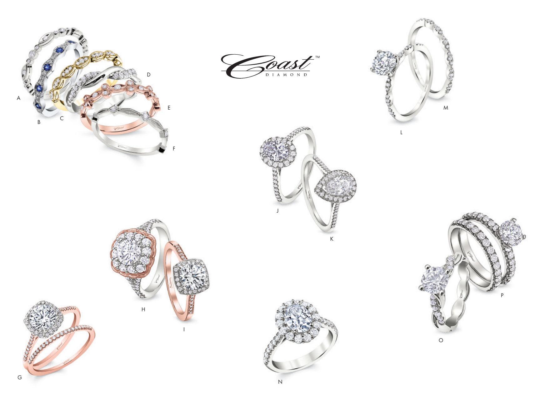
A. Diamond band with round and marquise shaped diamonds, $575 B. Pavé sapphire and diamond band with milgrain edging, $785 C. Diamond stackable band with marquise shapes and milgrain edging, $740 D. Braided diamond band, $1,070 E. Diamond stackable band with milgrain edging, $760 F. Diamond stackable band with diamond shapes and milgrain edging, $465 G. Petite cushion-shaped diamond halo semi-mount* with diamond pavé, $1,200; matching diamond band, $675 H. Floral inspired diamond halo semi-mount* with milgrain accent, $3,370 I. Cushion-shaped diamond halo semi-mount* with diamond pavé, $1,090 J. Oval-shaped diamond halo semi-mount* with diamond pavé, $1,090 J. Oval-shaped detail and diamonds across the top half of the band, $840 M. Diamond wedding band with scalloped detail, $860 N. Oval-shaped diamond halo semi-mount* with diamond on the shoulders, $1,310 P. Solitaire diamond band, $2,115 All items are crafted in 14kt gold and are available in 18kt gold or platinum.*Center stone priced separately.