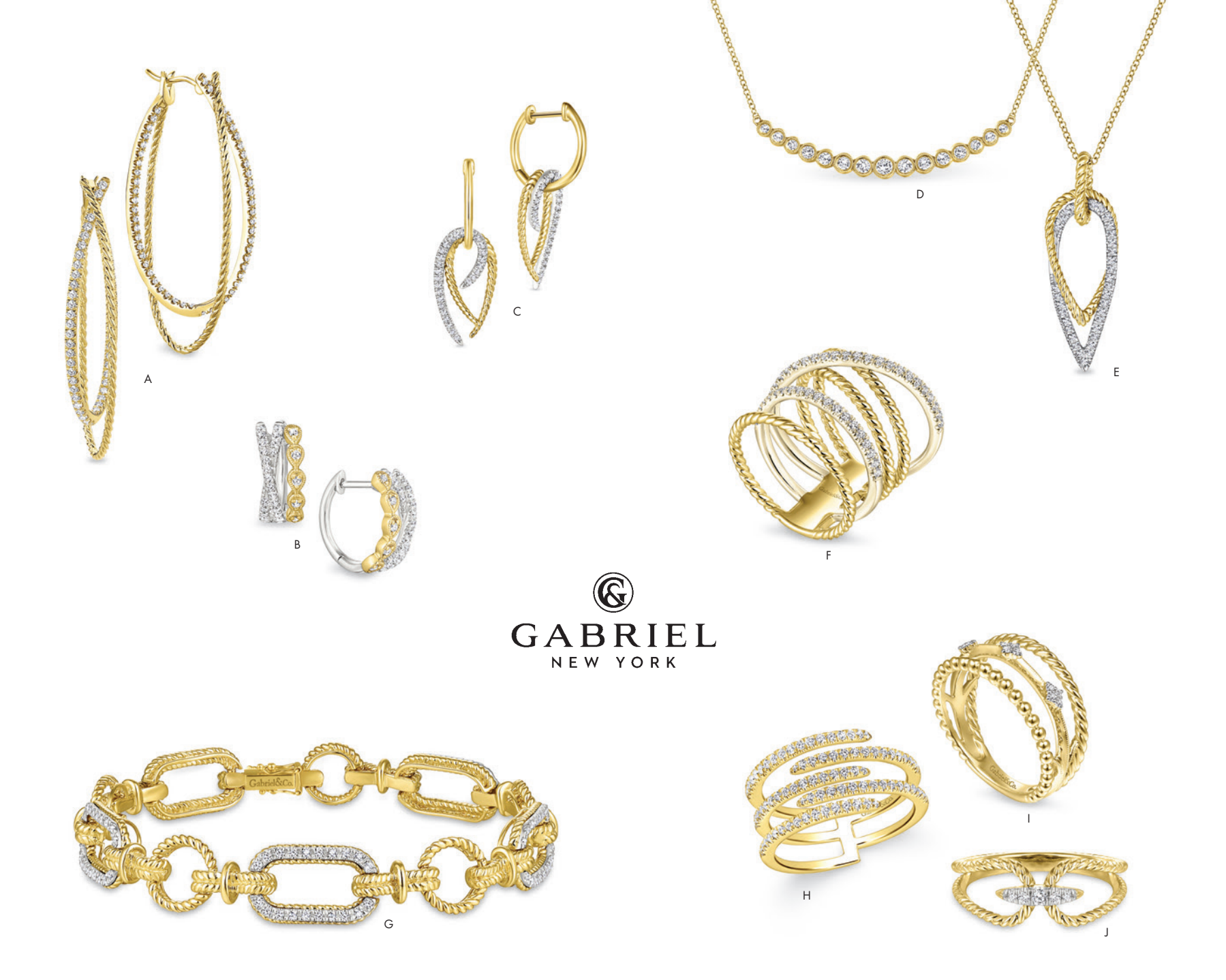
A. Elongated diamond earrings in 14kt gold, $3,240 B. Diamond fashion loops in 14kt gold, $915 C. Dramatic diamond dangles in 14kt gold, $1,135 D. Bezel set diamond necklace in 14kt gold, $1,400 E. Diamond pendant in 14kt gold, $880 F. Multi band diamond ring in 14kt gold, $1,770 G. Diamond link bracelet in 14kt gold, $3,550 H. Diamond fashion band in 14kt gold, $1,340 I. Three band ring in 14kt gold, $585 J. Ring with diamond accents in 14kt gold, $405