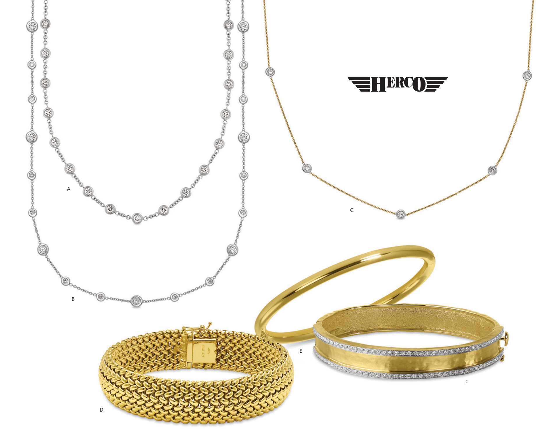
A. Diamonds-by-the-yard 18" necklace in 18kt white gold, $11,000 B. Diamonds-by-the-yard 34" necklace in 18kt white gold, $8,750 C. Diamonds-by-the-yard 16" necklace in 18kt two-tone gold, $2,250 D. 15mm mesh bracelet in 14kt yellow gold, $3,400. E. 4mm tube bangle in 14kt yellow gold, $850 F. 11mm diamond bangle in two-tone hammered 18kt gold, $8,950