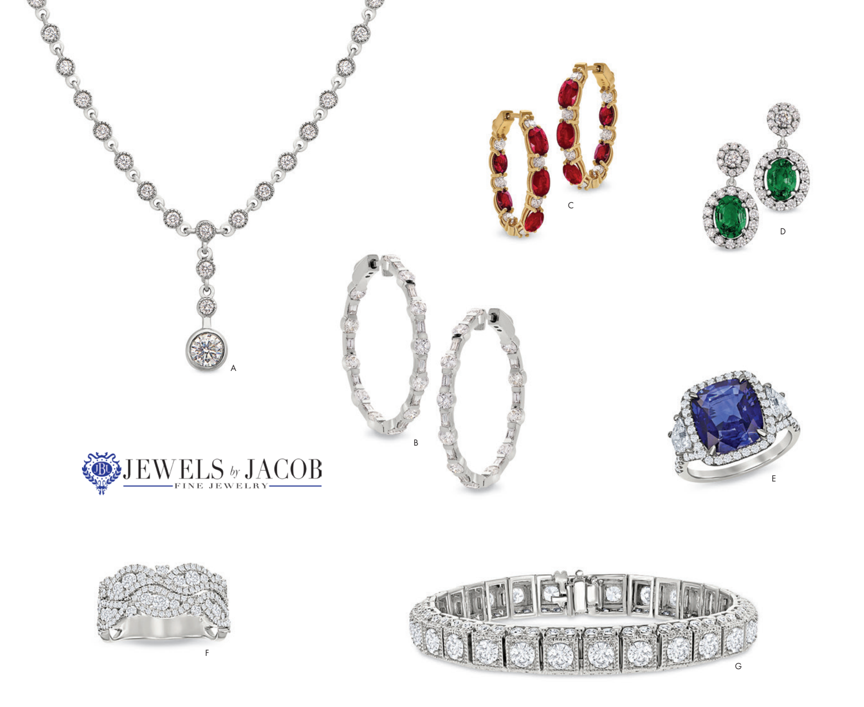
A. Diamond necklace in 14kt white gold, $7,650 B. Diamond hoop earrings in 14kt white gold, $12,000 C. Ruby and diamond hoop earrings in 14kt yellow gold, $14,000 D. Emerald and diamond earrings in 18kt white gold, $6,800 E. Sapphire and diamond ring in platinum, $46,000 F. Diamond fashion ring in 18kt white gold, $5,850 G. Diamond bracelet in 14kt white gold, $14,000