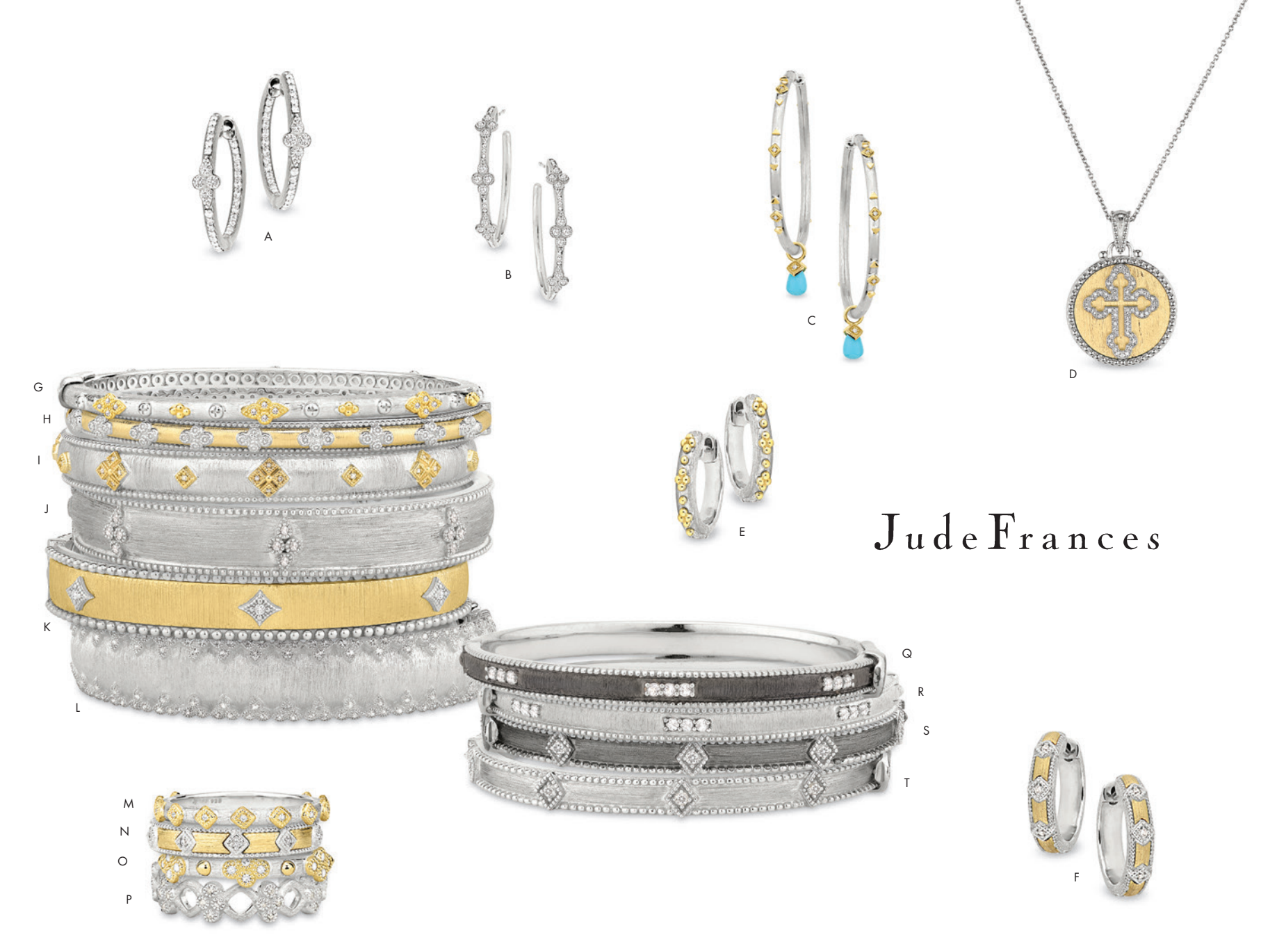
A. Provence small pavé hoop earrings with white topaz and black rhodium, $350 B. Moroccan quad pavé hoop earrings with white topaz, $360 C. Mixed Metal kite hoop earrings with turquoise briolettes, $850 D. Mixed Metal Guinevere pendant with pavé diamonds, 16" chain, $1,450 E. Mixed Metal beaded quad hoop earrings, $240 F. Mixed Metal diamond kite hoop earrings, $380 G. Mixed Metal quad bangle with bezel set diamonds, $740 H. Mixed Metal beaded quad cuff, $1,150 I. Mixed Metal kite cluster cuff with diamonds, $1,100 J. Moroccan quad cuff with white topaz, $540 K. Mixed Metal Nina beaded kite cuff with diamonds, $2,490 L. Continuous trio cuff with white topaz, $1,270 M. Mixed Metal diamond kite stacker ring with diamonds, $450 O. Mixed Metal beaded quad stacker ring with diamonds, $450 P. Open Provence band with white topaz, $270 Q. Lisse bangle with white topaz and black rhodium, $490 R. Lisse bangle with white topaz, $490 S. Lisse kite shape bangle with white topaz and black rhodium, $490 T. Lisse simple kite shape bangle with white topaz, $490 Mixed Metal Collection is crafted in sterling silver and 18kt gold. Lisse, Moroccan and Provence Collections are crafted in sterling silver.