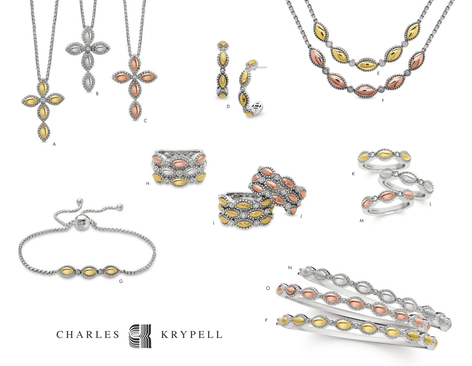
A. Sterling silver cross with 18kt yellow gold and diamond, $695 B. Sterling silver cross with diamond, $385 C. Sterling silver cross with 18kt rose gold and diamond, $695 D. Sterling silver cross with 18kt yellow gold accents, $980 E. Sterling silver necklace with 18kt yellow gold and diamonds, $1,390 F. Sterling silver necklace with 18kt rose gold and diamonds, $1,390 G. Sterling silver Bolo bracelets with touches of 18kt yellow gold and diamonds, $420 H. Tri-Color three row band ring with sterling silver, 18kt rose and yellow gold accents with diamonds, $970 I. Three row band ring with sterling silver and 18kt yellow gold and diamonds, $1,230 J. Three row band ring with sterling silver and 18kt yellow gold and diamonds, $1,230 J. Three row band ring with sterling silver and 18kt yellow gold and diamonds, $1,230 J. Three row band ring with sterling silver and 18kt rose gold and diamonds, $1,230 K. Sterling silver single ring with 18kt rose gold and diamonds, $1,230 K. Sterling silver single ring with 18kt rose gold and diamonds, $385 N. Sterling silver single ring with 18kt rose gold and diamonds, $385 N. Sterling silver single with 18kt rose gold and diamonds, $385 N. Sterling silver bangle with 18kt rose gold and diamonds, $1,190 P. Sterling silver bangle with 18kt yellow gold and diamonds, $1,190