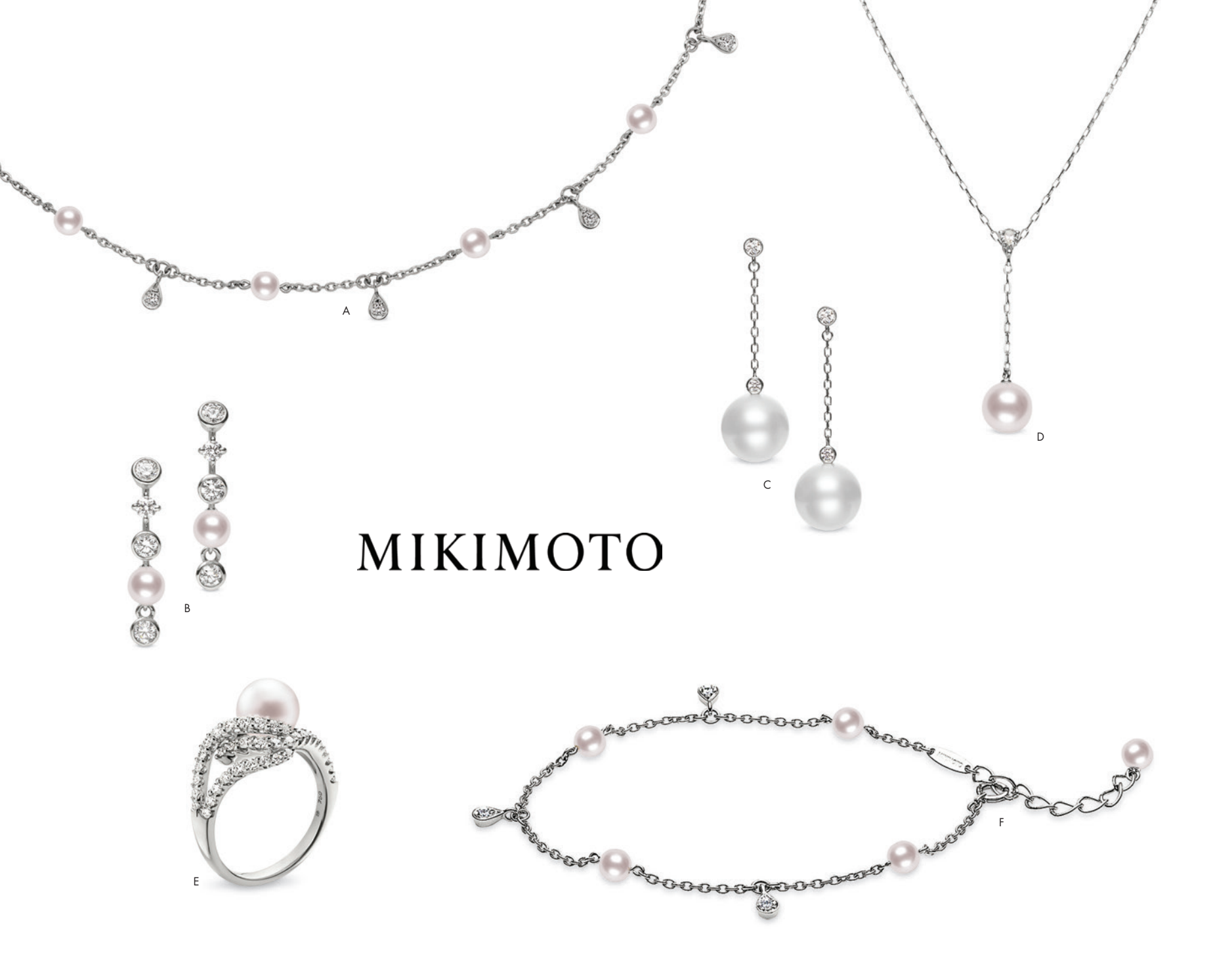
A. Akoya cultured pearl and diamond necklace, $1,150 B. Akoya cultured pearl and diamond earrings, $1,750 C. White South Sea cultured pearl and diamond drop earrings, $6,700 D. Akoya cultured pearl and diamond pendant, $1,200 E. Akoya cultured pearl and diamond ring, $4,300 F. Akoya cultured pearl and diamond bracelet, $1,350