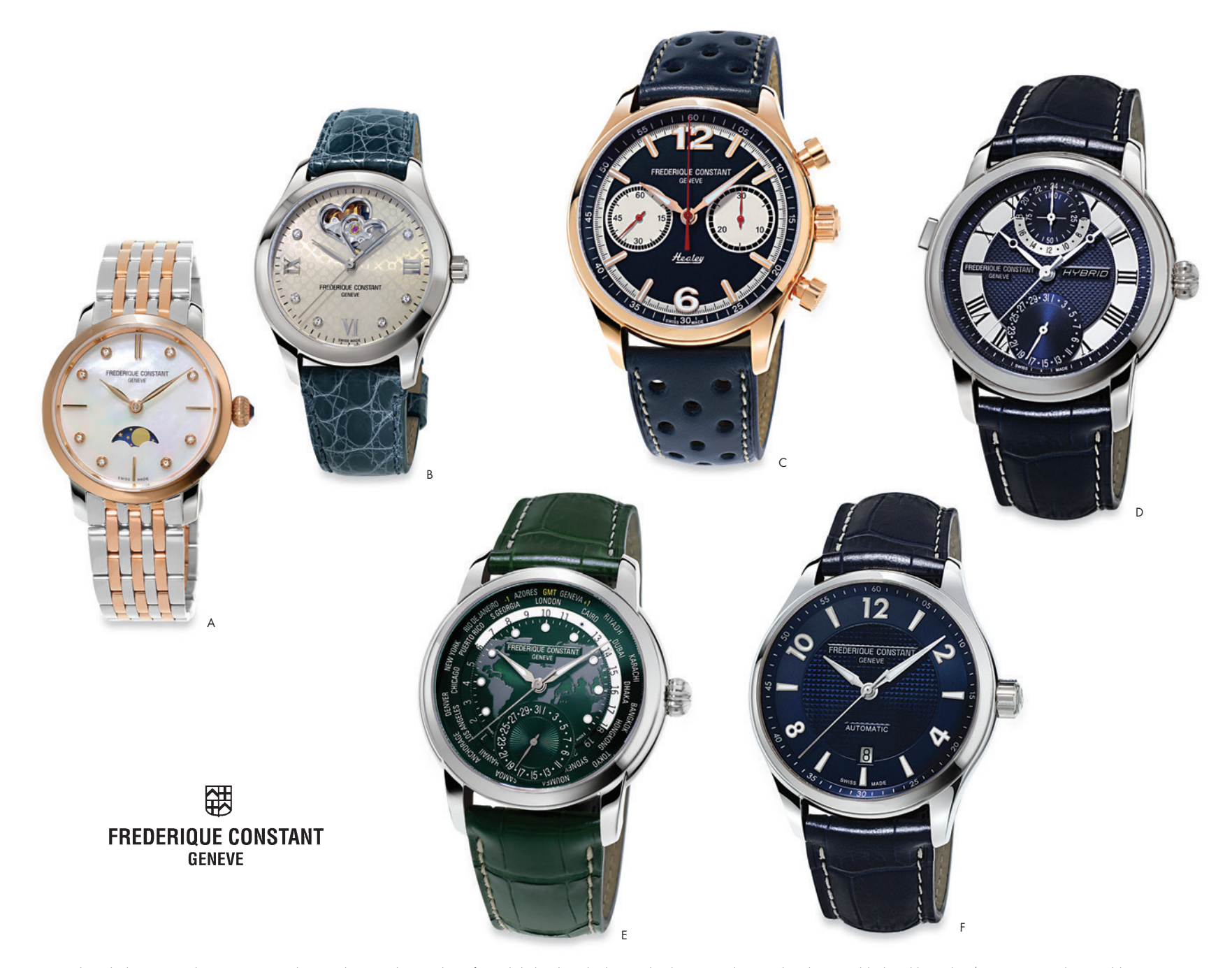
A. Ladies Slimline Moonphase, 30mm stainless steel case, white mother-of-pearl dial with eight diamond indexes, stainless steel and rose gold-plated bracelet, $1,495 B. Ladies Double Heart Beat Automatic, 36mm stainless steel case, light grey dial with Roman numerals and six diamond indexes, teal alligator strap, $1,695 C. Healy Chronograph Automatic, 42mm rose gold-plated steel case, navy dial with applied indexes, navy leather strap, limited edition of 2,888 pieces, $3,095 D. Classic Hybrid Manufacture, 42mm stainless steel case, navy guilloché decoration dial with Roman numerals, navy alligator strap, $3,695 E. Worldtimer Manufacture, 42mm stainless steel case, dark green dial with Roman applied dots, dark green alligator strap, $4,195 F. Runabout Automatic, 42mm stainless steel case, navy dial with applied indexes, navy leather strap, limited edition of 2,888 pieces, $1,595